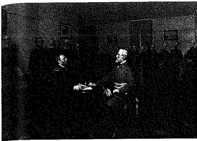
General Lee surrenders to General Grant at Appomattox Courthouse.

As the Confederates surrendered, Union soldiers began to cheer. Grant ordered them to be silent. "The war is over," he said. "The rebels are our countrymen again."